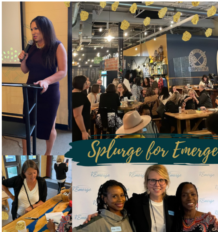
Above: 2022 11th annual Splurge for Emerge at Broken Clock Brewery in Minneapolis, MN